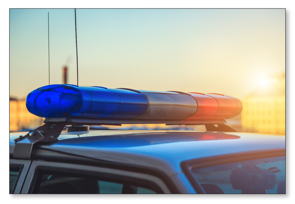
THE TRAINING WILL FOCUS ON THE RESPONSIBILITY AND DUTIES OF SCHOOL RESOURCE OFFICERS, AS WELL AS LEGAL ISSUES OFFICERS MUST BE AWARE OF, AND CLASSROOM TECHNIQUES USED TO HANDLE EXCEPTIONAL STUDENTS.

RichmondCC's SRO training will kick off this summer with a foundation course open to all certified law enforcement of-