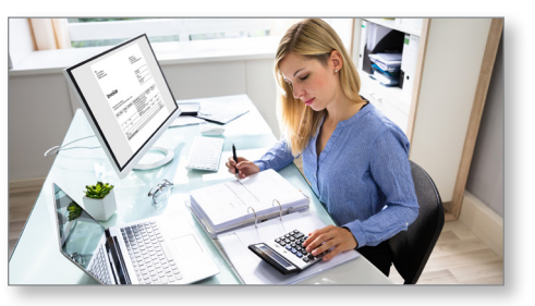
Intro. to Quick Books - Online This is an introductory course for individuals wanting to learn QuickBooks, a powerful bookkeeping software for small businesses. Students will learn how to identify parts of the screen, work with lists, enter sales and invoices, enter payments and deposits, pay bills, work with bank accounts, analyze financial data, track and pay sales tax, and create payrolls. Students will also do career exploration. Oct. 5-28 - $70

communication skills needed to interact with Spanish-speaking employees, patrons, co-workers and customers in the workplace. You will learn the correct vocabulary and expressions used to respond to Spanish-speaking individuals. Oct. 4 - Dec. 6 - Cost $70