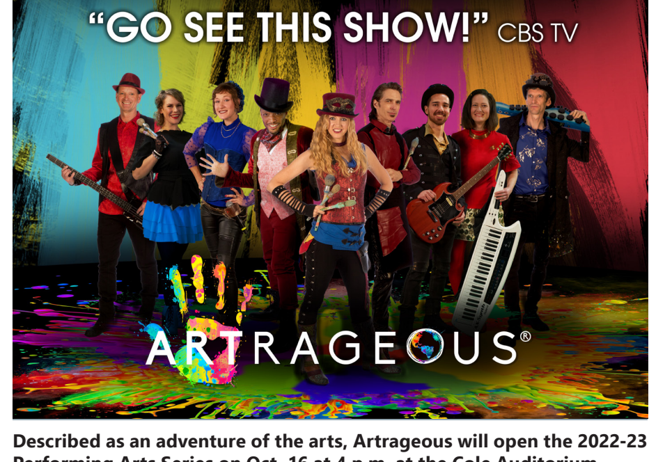
Performing Arts Series on Oct. 16 at 4 p.m. at the Cole Auditorium.