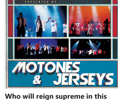
performance of the Motones & Jerseys on April 4 at 7:30 p.m.?