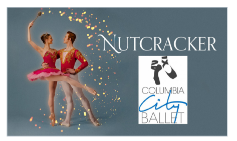
The Columbia City Ballet will present the beloved Nutcracker on Nov. 29 at 7:30 p.m.