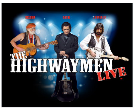
The Highway Men Live will pay tribute to three country music legends on Feb. 16 at 7:30 p.m.