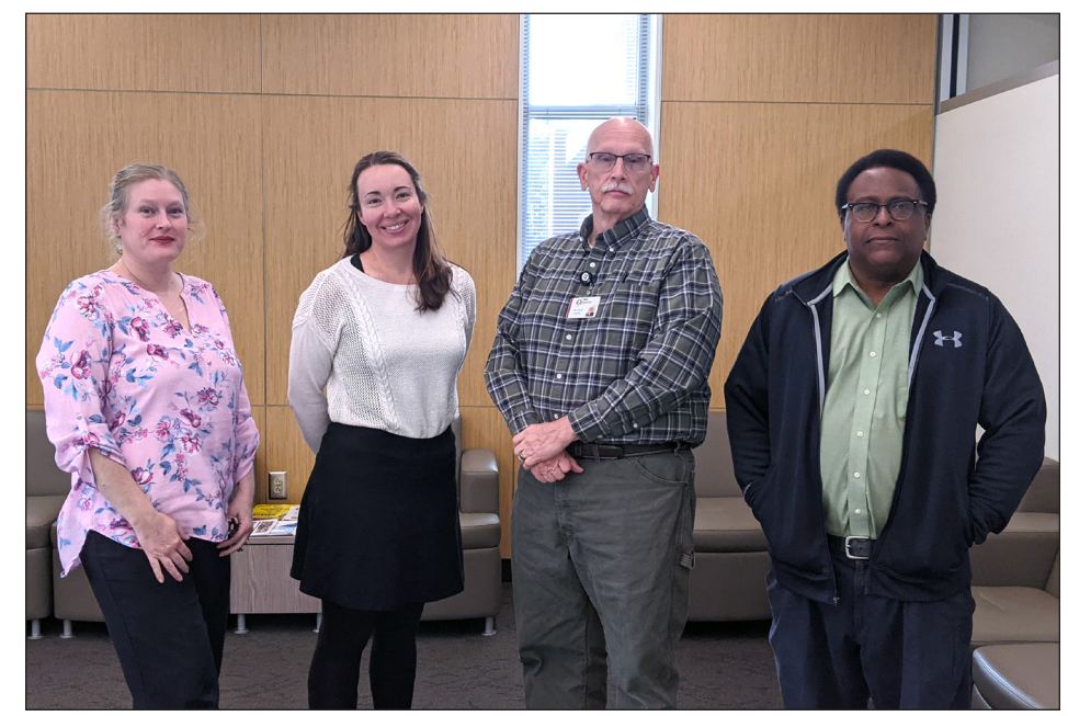
Richmond Community College counselors, who have played a major role in registering students in the past, will now shift their focus to counseling and the mental health of students.

Counselors are working on engaging students both on and off campus by developing and