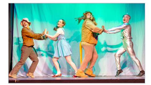
"The Wizard of Oz" musical will come to life on the stage of the Cole on Nov. 5 at 2 and 5 p.m.