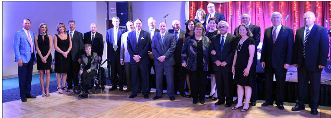
Pictured are the Corporate Sponsors for this memorable event for the College.