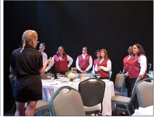
Student Ambassadors work hard during their internship, providing assistance with many college events from graduation to registration.