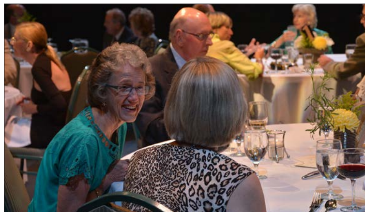
Members of the Director's Circle were treated to a gourmet dinner served on stage at the Cole Auditorium to conclude the 2013-2014 DeWitt Performing Arts Series.