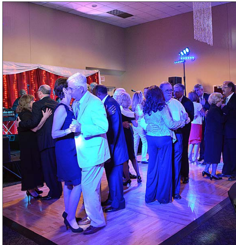
The Cole Auditorium was transformed into a glamorous ball room for RCC's 50th Anniversary Gala, and a live band kept the crowd entertained well into the night.