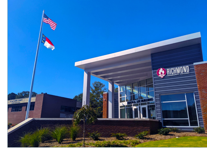
After two name changes, we are now Richmond Community College. In 2020, the renovations to the Lee Building were completed, giving the College a fresh new look.