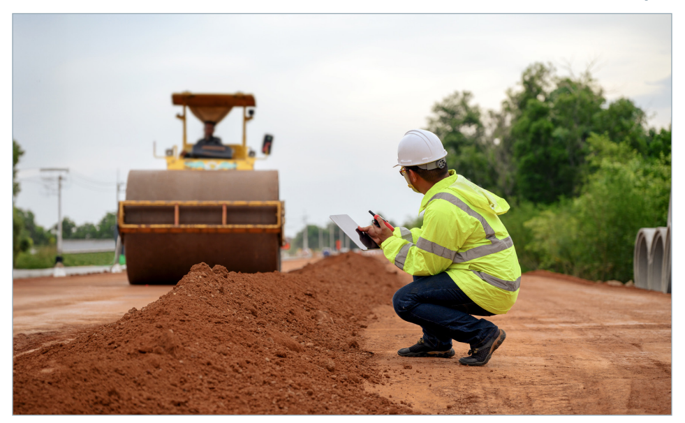
There is no cost to enroll in the two-week Highway Construction Trade Academy at Richmond Community College that runs July 29-Aug. 9.